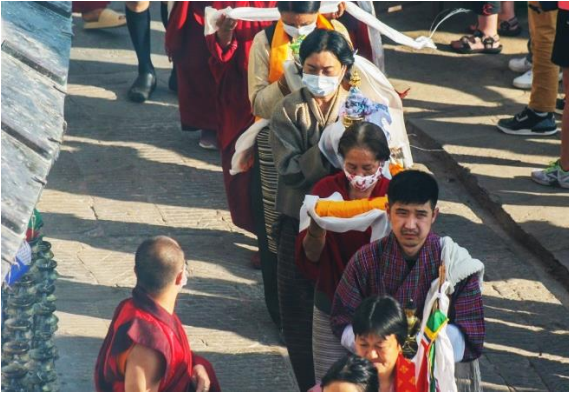
Tulku's family circumambulate the mahacaitya with offerings