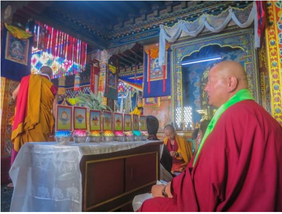
The Dongag Choling konyer is offered the eight lucky symbols