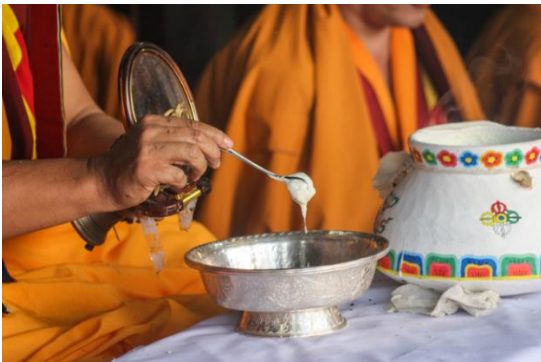
Dorje Lupon offers rice pudding to the mahacaitya.