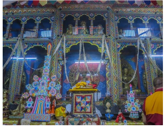
The shrine is hung with strings of trumpet seed flowers and five coloured khata

The events of the third and final day, 7 th November, also began early, and were completed by lunchtime.