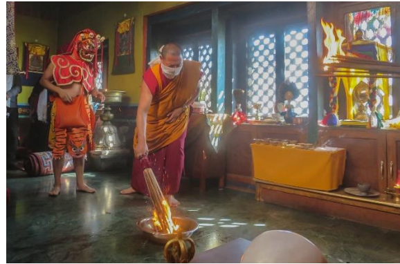
Fire cham by Sangye Choling monks