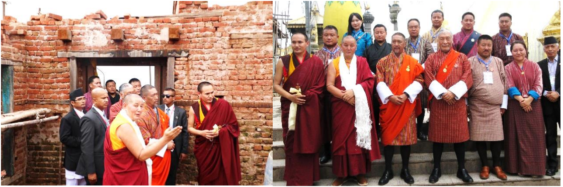
Figure 4: Chief Advisor of the Interim Government of Bhutan, Lyonpo Tshering Wangchuk visits the ongoing work in August 2018 (FSMC, 2019, p. 64)

Dongag Choling is the only building at Swayambhu which was rebuilt using traditional materials and methods as required by international heritage principles. The Royal Government of Bhutan funded the majority of the structural works, supplemented by contributions from Sangye Choling and those raised by the konyer and private donors, plus donations for the repair of various objects as well as direct offerings including a new Manjusri statue.