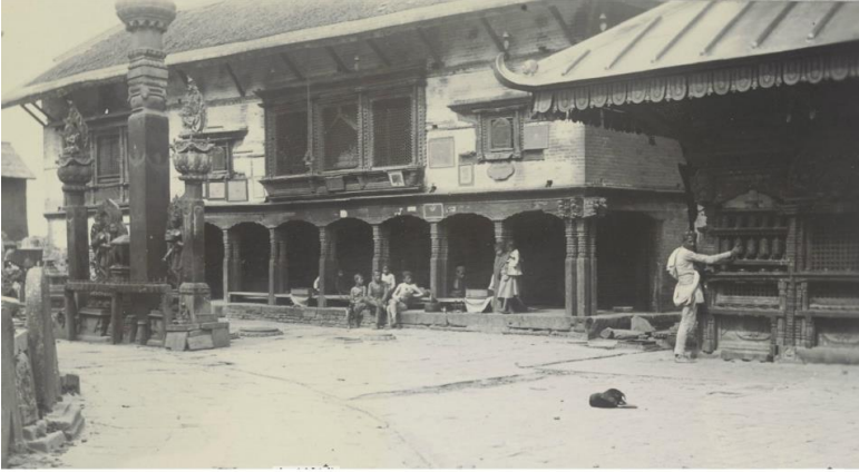
Figure 1: 1901 Herzog and Higgins (Photo looking south west)

The previously Newar two storey sattal 16 (Fig. 1) was rebuilt with a flat roof, “Himalayan” style, sponsored by the Sikkimese royals. New statues and a mani wheel were donated by Newars with trading connections with Tibet (Shakya 2004, pp. 309, 492, 611). The ground floor was retained as a public space while the temple on the first floor retained the central triple bay Newar window (Fig. 2), an unusual architectural combination even in the Kathmandu valley. 17