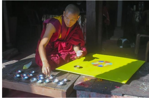
Sand mandala prepared for fire offering between the temple and the mahacaitya