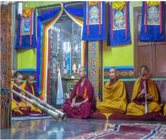
Entrance to the gonkhang established by the 68 th Je Khenpo