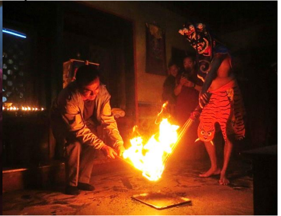
Fire cham by Sangye Choling monks