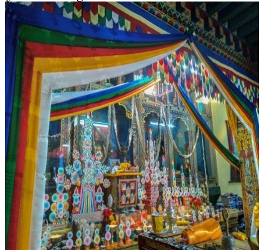
Shrine decorated with five coloured khata and strings of trumpet flowers

Since the temple is relatively small, situated to the west of the mahacaitya on top of the hill, a larger celebration to the east of the mahacaitya enabled official guests to be invited. This included representatives of the Government of Nepal, Guthi Sansthan and other dignitaries.