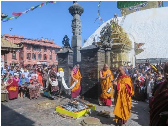
Dratshang monks and tulku's maternal uncle circumambulate the fire in front of Swayambhu mahacaitya