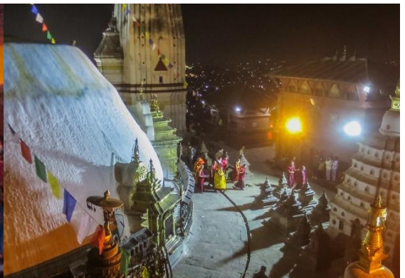
Cleansing the area around Swayambhu mahacaitya