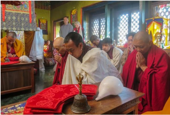
Tulku's family offer supplications and aspiration prayers